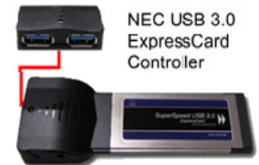
*Shown bundled w/ ExpressCard